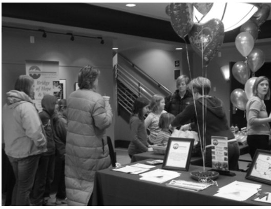
Above: movie patrons choose snacks and pick up Bridge of Hope information in the theater lobby.